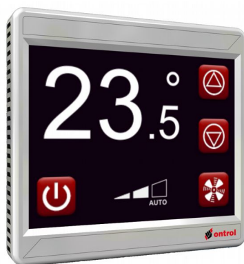
FRAME STYLE 1